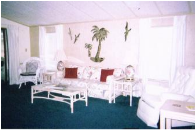
Table with 4 chairs. Wicker loveseat and chair. Ceiling fan.